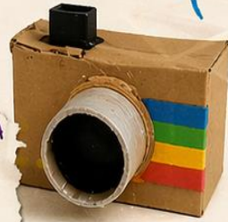
A CAMERA capture every moment!