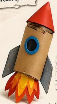
A ROCKET reach for the stars!