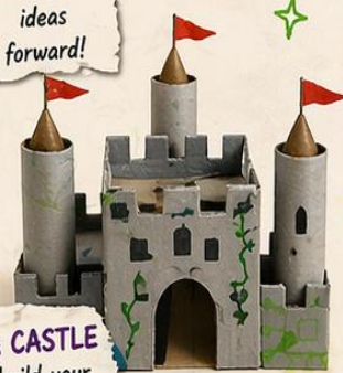
A CASTLE build your own world!