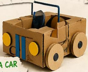
A CAR drive your ideas forward!