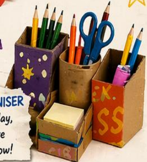
AN ORGANISER tidy today, achieve tomorrow!

SEE IT. BUILD IT. SHARE IT. BE PROUD OF IT! SCIENCE. TECHNOLOGY. ENGINEERING. MATHEMATICS.