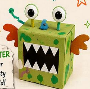
A MONSTER let your creativity run wild!