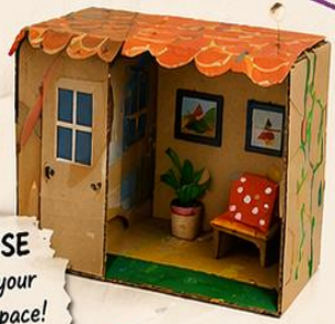
A HOUSE design your dream space!