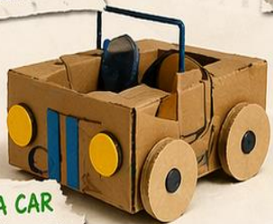
A CAR drive your ideas forward!