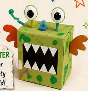
A MONSTER let your creativity run wild!