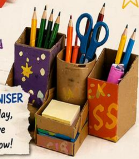
AN ORGANISER tidy today, achieve tomorrow!

SEE IT. BUILD IT. SHARE IT. BE PROUD OF IT! SCIENCE. TECHNOLOGY. ENGINEERING. MATHEMATICS.