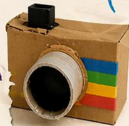
A CAMERA capture every moment!