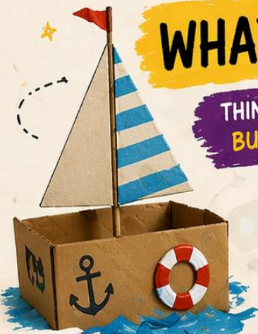
A BOAT sail away on new ideas!