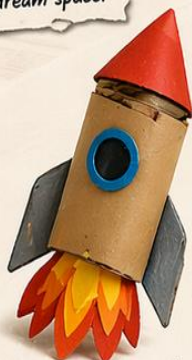
A ROCKET reach for the stars!