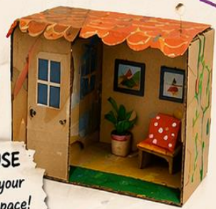
A HOUSE design your dream space!