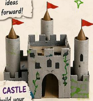
A CASTLE build your own world!