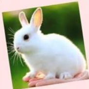
FLOPPY PALOMA 6M

Please include: Bunny's name, your child's name and class