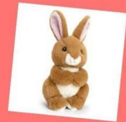
HOPPY ISABELLA 3J