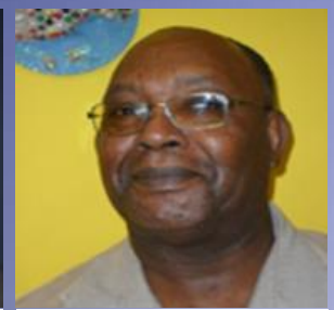
Bevin Betton LA Governor