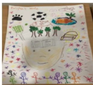
Year 1 - Ralphie (1B)