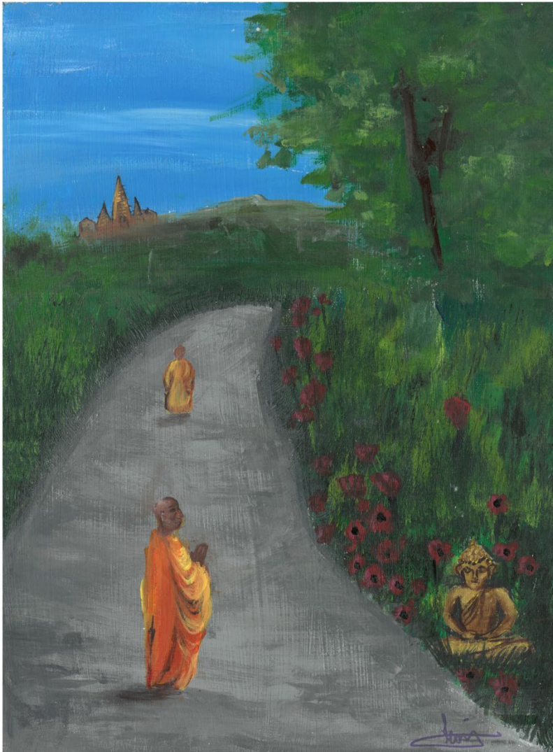
Leonie, aged 13