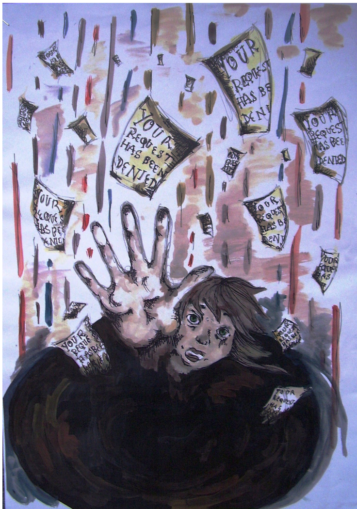
Penny, age 15