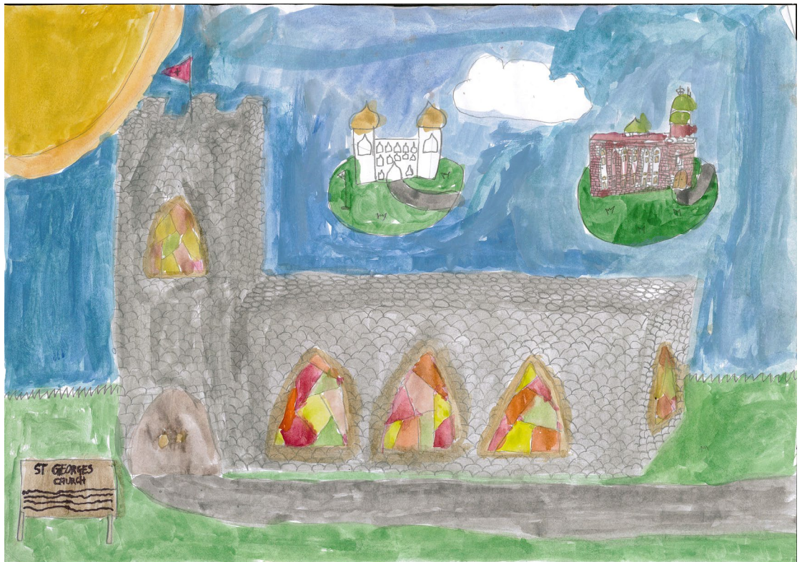
Beth Meachem, age 9