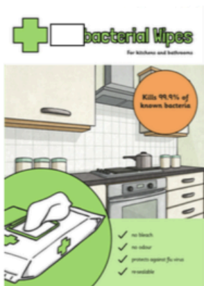
d) _____ bacterial wipes