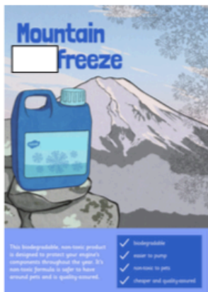
a) _____ freeze