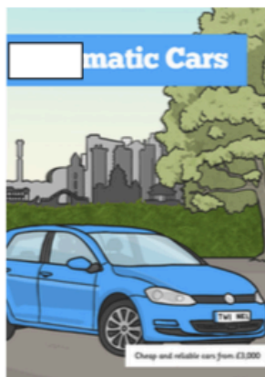
e) _____ matic car