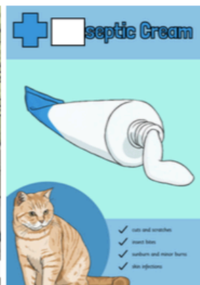
f) _____ septic