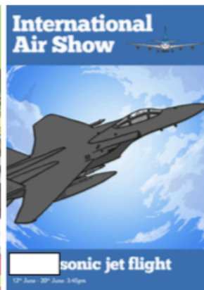
c) _____ sonic jet