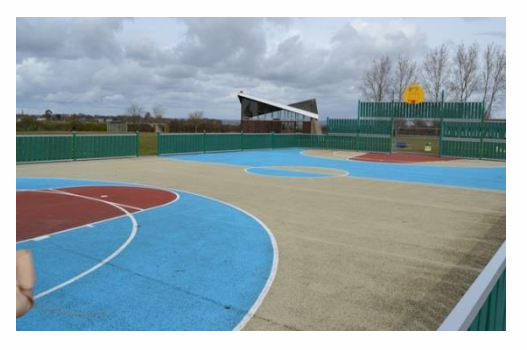
All Weather Sports Pitch