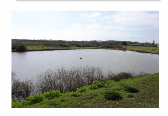
Water Sports Lake